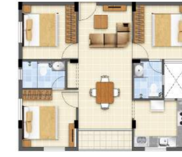
FLAT-A3 1067 Sq.ft