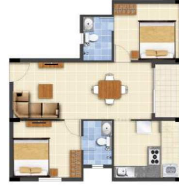
FLAT-A3 991 Sq.ft