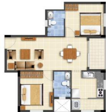
FLAT-A5 985 Sq.ft