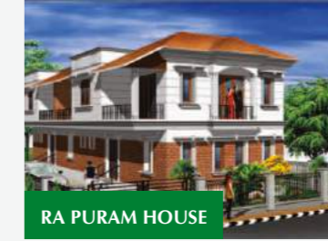
RA PURAM HOUSE