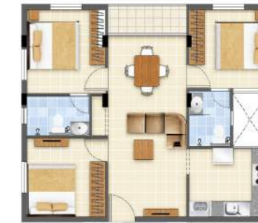
FLAT-A2 1067 Sq.ft