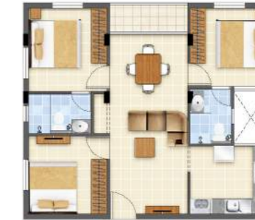
FLAT-A1 1067 Sq.ft