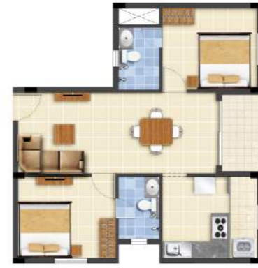
FLAT-A2 991 Sq.ft