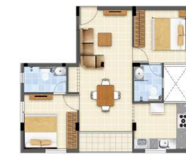
FLAT-A4 928 Sq.ft