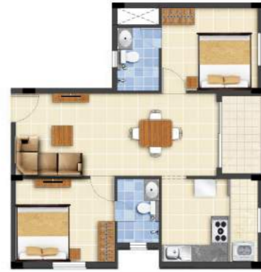
FLAT-A1 996 Sq.ft