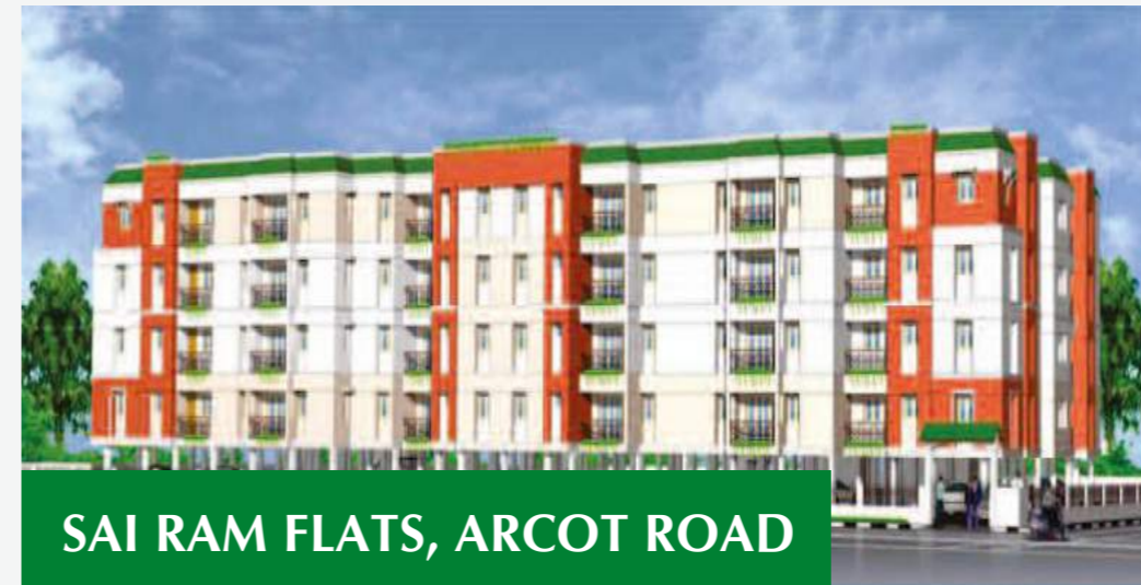
SAI RAM FLATS, ARCOT ROAD